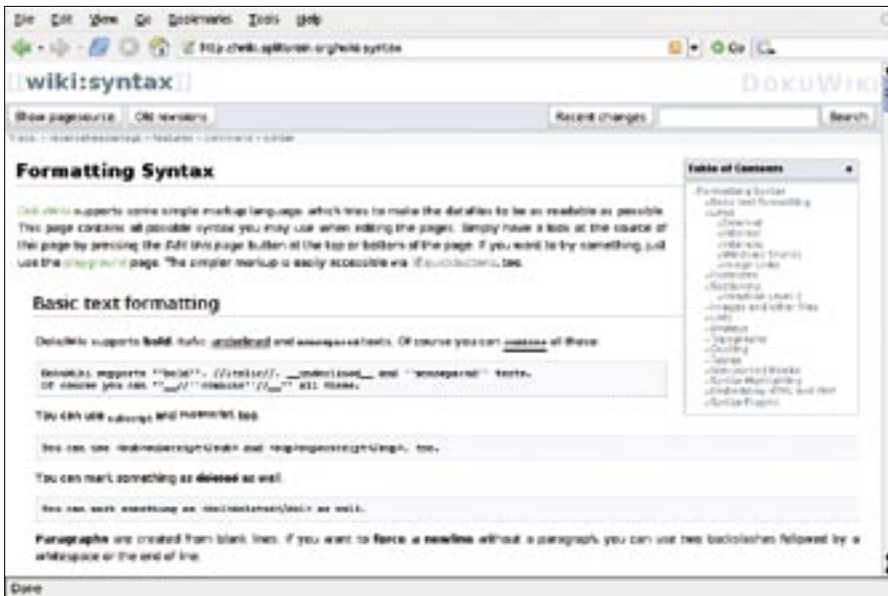
Figure 4: Dokuwiki is well-suited to documenting technical processes.

variant [14], a useful tool for getting to know the wiki, if installed locally.