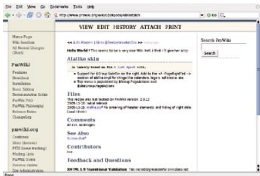
Figure 3: PmWiki is feature-rich and nicely documented.

PmWiki [13] stores articles in flat text files; it requires a web server with PHP version 4.1 or newer. The basic setup is just as easy to install as any of the wikis we have looked at thus far: just unpack the source code archive in a directory on the web server and load the index page to launch the wiki. Besides the server-based version, there is also a standalone