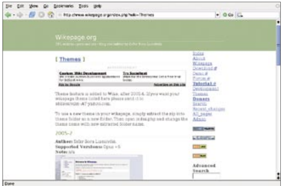
Figure 1: The simple structure of Wikepage lends itself to quick deployment, though the general lack of documentation slows down the creative process.

Themes let you change the look, and there are a number of examples that you can use for your experiments at [8].