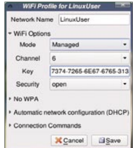
Figure 2: WiFi-Radar requires hexadecimal notation for the WEP key.

Because I was able to set up the connection manually using iwconfig and wpa_supplicant , this is very likely a WiFi-Radar bug.